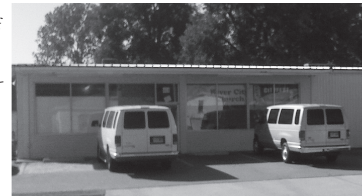
The new River City Church building located at 620 E. Curtis Sykes in North Little Rock.

is $34,300. We have essentially depleted all of our reserves and are now down to monies needed for regular operations. A list of projects completed, as well as an itemized list of things to be done (along with corresponding estimated costs) is available upon request. If you are so moved to help with this effort, we would be grateful. Further inquiry into these matters is welcome. Please keep us in your prayers.